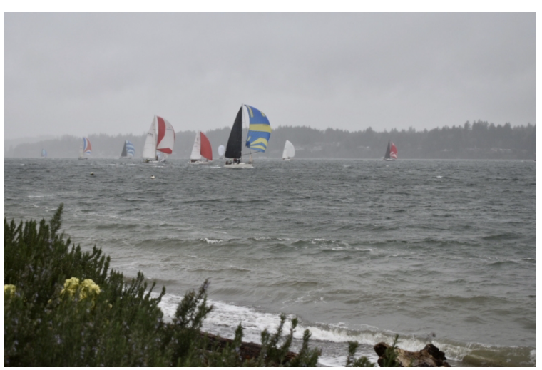
2020 Toiva Shoal Race

This year, we had no choice but to hold it