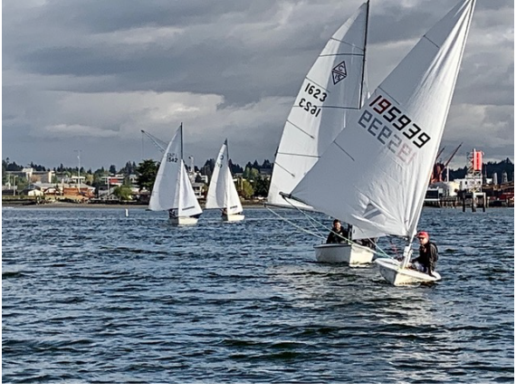
Dinghy Racing May 5

June is here, with it the longest days of the year. One of my favorite things about Wednesday night racing is sailing in after finishing. Encourage your crew to take the helm or try different jobs around the boat as the evenings racing intensity