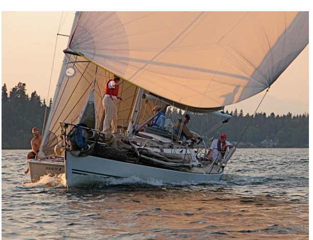
Charlemagne under sail

One of my favorites was about when he was working as a bank manager in Anchorage when the big one hit in 1964. He pulled several clerks out from a collapsed building.