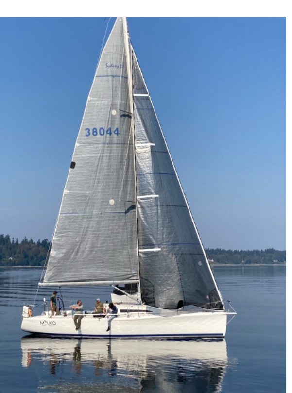
Fall Series non race

We all need to focus on safety on the water, especially during the winter season. Strong winds and cold rain can make minor incidents into big problems. Have you practiced man-overboard procedures